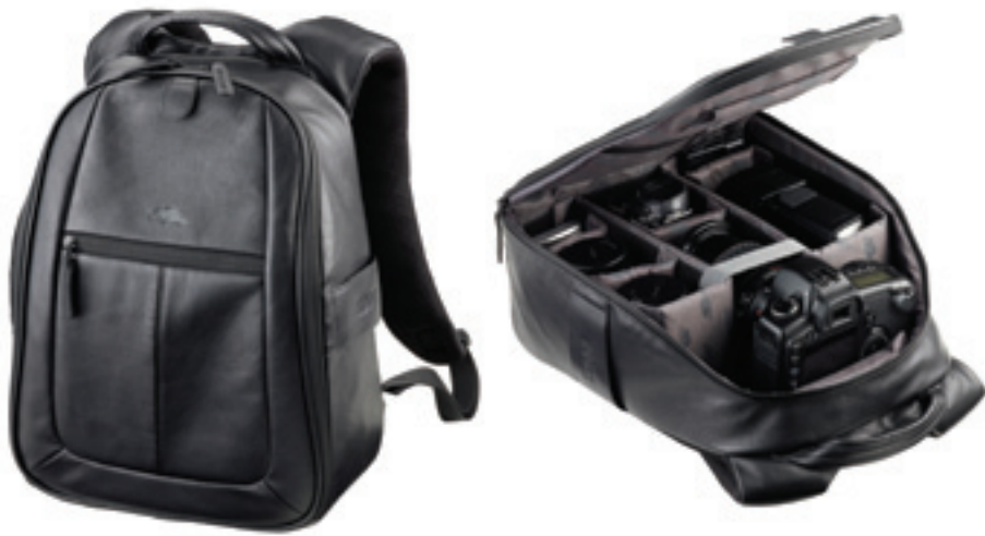
Most of the latest backpacks in larger sizes provide a padded slot for a full-size laptop computer; and some of the packs are primarily for urban use. The Roots Leather Digital Camera Backpack qualifies in this respect.

look at something with space for their future investment."