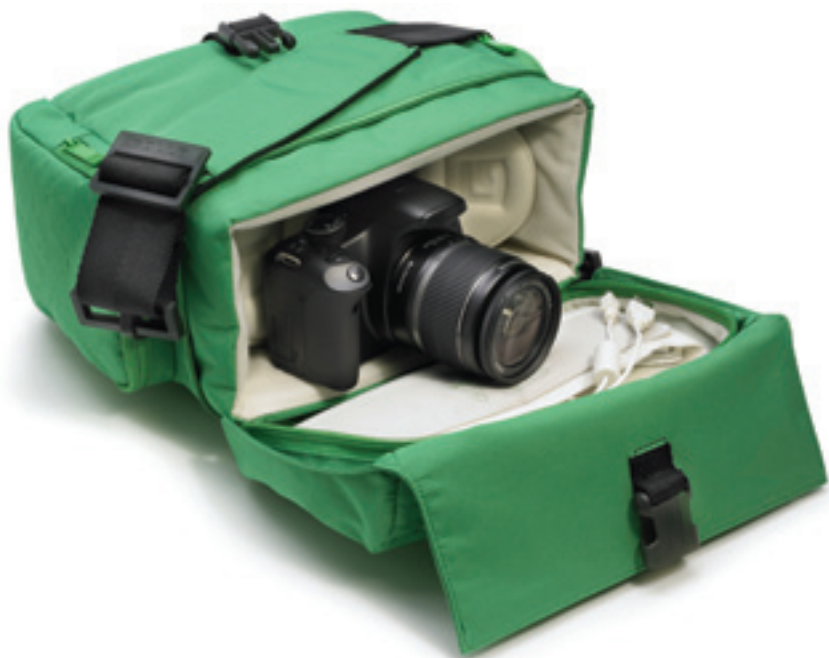
Distributed by Fidelity Electronics, the Finnish brand Golla targets style-conscious photographers, with a large variety of configurations and funky colours.

many are switching to a sling. Some weeks, they make up 80% of our bag sales," he estimates. "They don't look like camera bags, so they're less conspicuous. Some are quite large, so they're attractive to DSLR buyers who own multiple lenses and accessories."