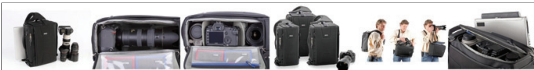
ThinkTank's Sling-O-Matic series can be switched from one shoulder to the other. The fully padded shoulder strap slides along a set of rails, making it easy to change its location.