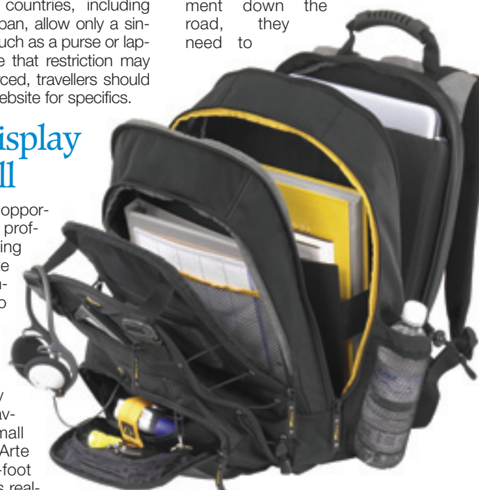
The CityGear Chicago backpack from Targus can hold a 16" laptop, but also provides lots of space for other equipment, including cameras and accessories.

There's definitely an opportunity for greater profitability by increasing the attachment rate of bags to new cameras. Some photo specialty retailers already boast impressive numbers. At BellArte Camera, it's roughly 60%. In spite of having relatively small premises, BellArte devotes a 30x10-foot wall to bags. But it's really customer service that has been responsible for steady sales.