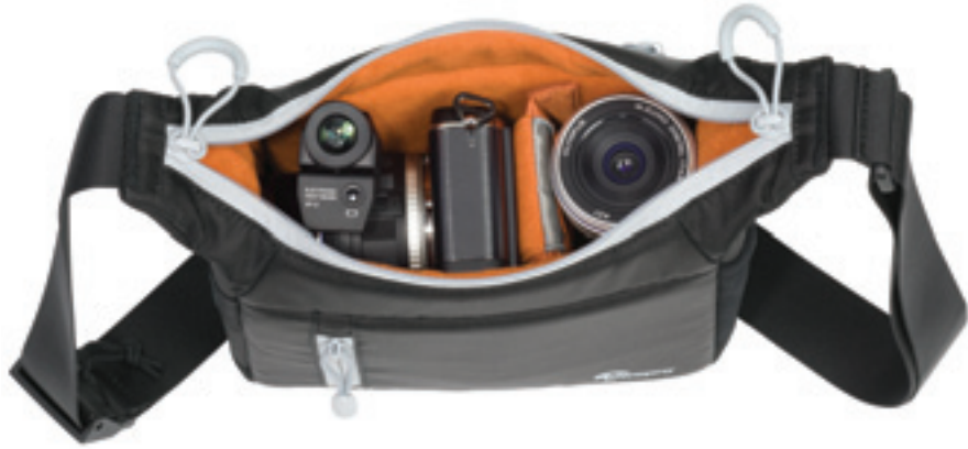
Lowepro's Streamline 100 shoulder bag can accommodate a Compact System Camera like an Olympus Digital PEN, Panasonic Lumix G, Samsung NX and Sony NEX, plus a second lens and accessories.