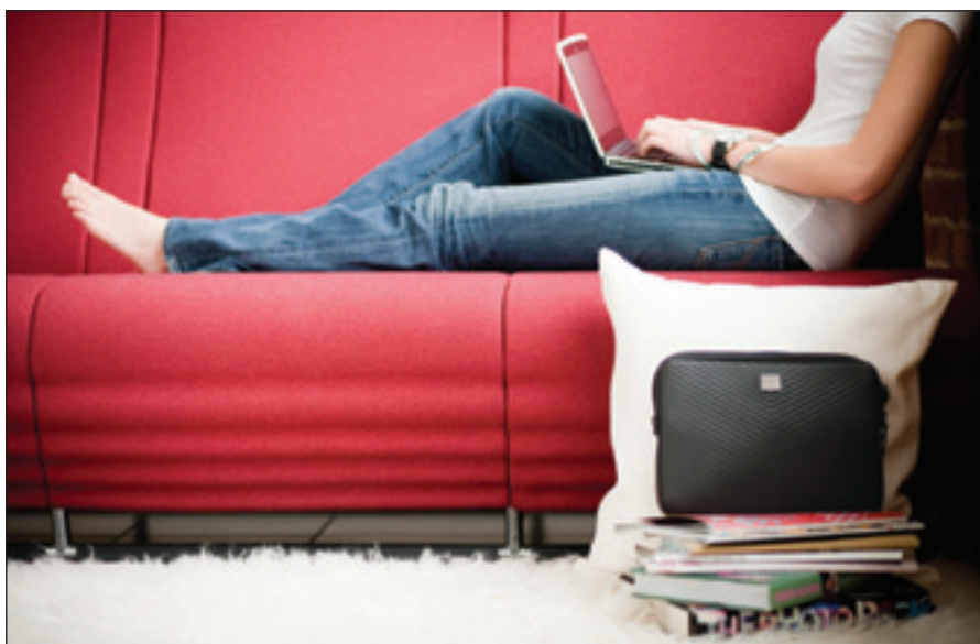
Notebook and iPad sleeves like this model from Acme Made can be used to update the functionality of many full-size camera bags.

Shootout Sling series, which provides quick access to the camera compartment. Features include durable, water-resistant nylon instead of the more common polyester for the exterior, weather-sealed YKK zippers, and a WeatherWrap rain cover. Some retailers carry Tamrac's Velocity Sling series instead, with a comfortable padded