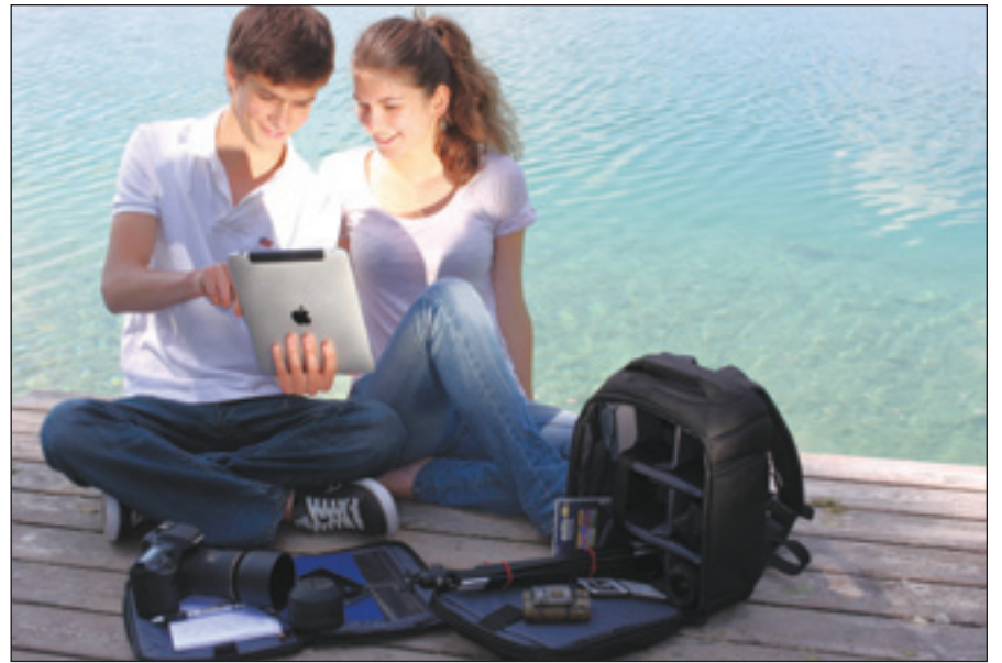
Available in different sizes and configurations, Tamrac's new Zuma series provide a slot for an iPad or 10" netbook, in addition to a compartment for a camera and paraphernalia.