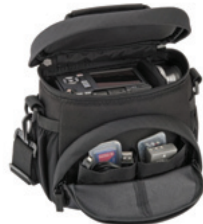
Featuring a carrying handle, belt loop and adjustable shoulder strap, the Tamrac Aero 36 can accommodate a mirrorless camera with a kit zoom lens in a foam-padded compartment with internal dividers, while pockets hold accessories