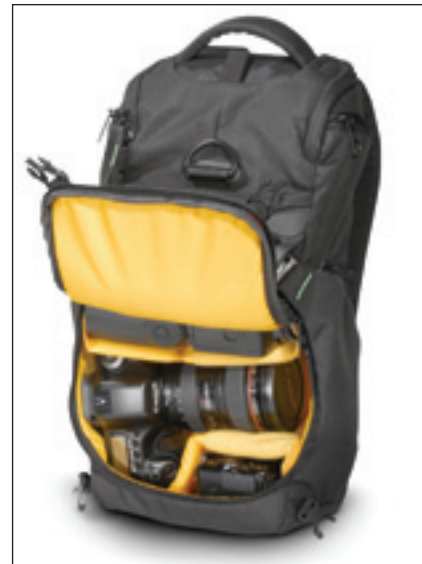
Tamrac Evolution Sling Backpacks can be worn as a backpack, or as a sling pack over either shoulder.