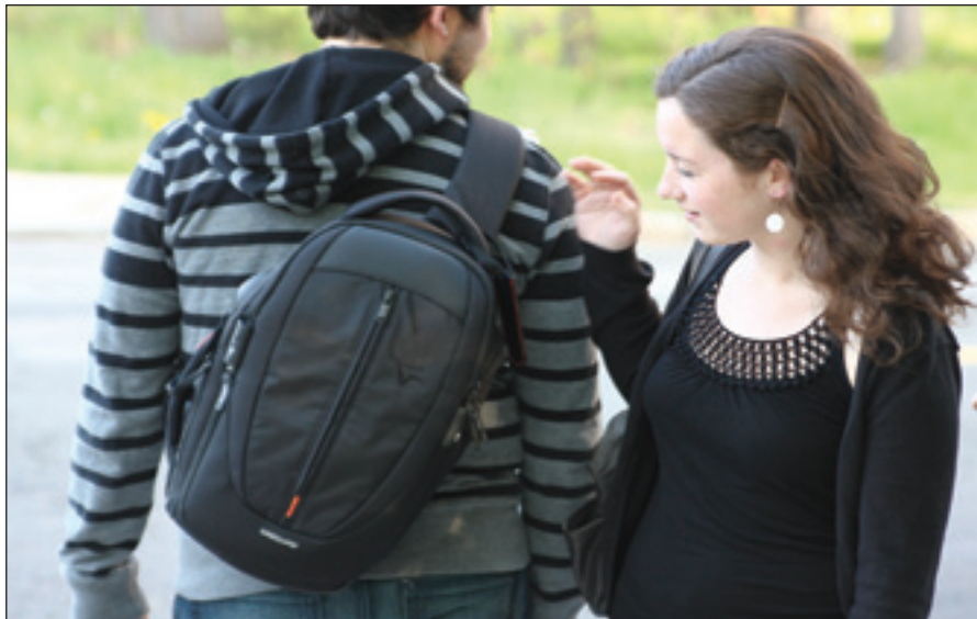
Distributed in Canada by Digitec Trading, Vanguard's UP-Rise 43 DSLR Sling expands when necessary with one easy zipper motion, and can shrink back down when less equipment is being carried.