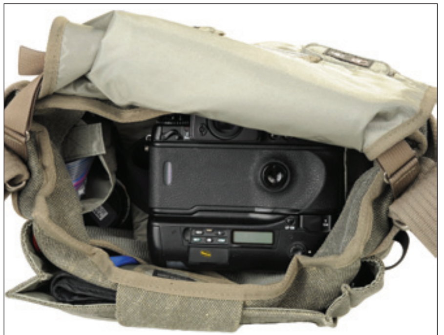
ThinkTank's soft-sided Retrospective bags, distributed in Canada by Nadel Enterprises, compress naturally to fit the gear they contain.