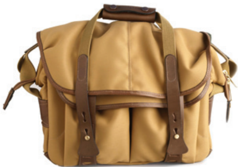
British-made Billingham bags, distributed by Kindermann Canada, feature waterproof canvas, leather trim, brass buckles, woven web strapping, and large shoulder pads.

wear and makes it easy to get at your gear; the Ultra-Cinch Camera Chamber holds equipment snugly so it does not bounce around while in motion."