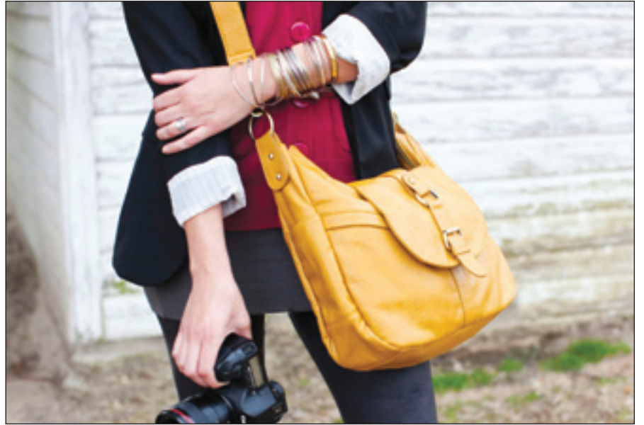
Kelly Moore camera bags, some of which come in bright pop colours, look like purses. They have internal dividers, and are available in different styles and configurations.

strap and a Tuck-A-Way waist belt, plus Quick Flip top door that flips away from the user's body for convenience.