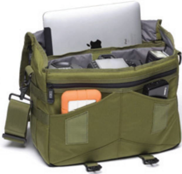
Distributed by Gnigami, Tenba's Mini Messenger bags have a dedicated sleeve that can accommodate a tablet or small notebook PC.