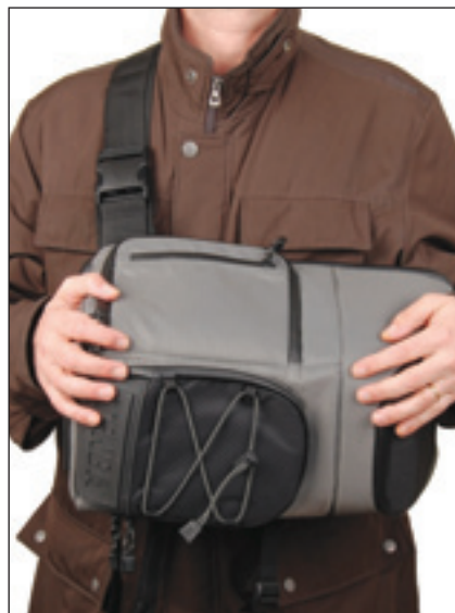
Providing quick access to camera and accessories, Tenba's Shootout Sling bags are made of water-resistant nylon and feature weather-sealed zippers and a WeatherWrap rain cover.