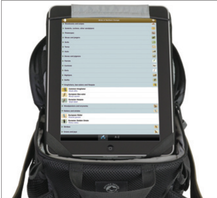
Designed for birdwatchers and other nature hobbyists, Lowepro's Optic Field Station has a pullout shelf that can accommodate a tablet, providing ready access to reference material in the field.