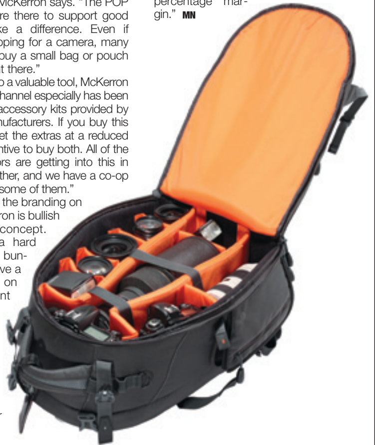
Vanguard's Skyborne 53 photo backpack can accommodate two DSLR bodies, plus seven (or more) lenses, and a couple of flash units; plus zippered pockets for memory cards and other small items, and a separate section for a 17" notebook. A rain cover protects contents from the elements, while air-infused padding helps prevent damage from bumps. Interestingly, the $330 backpack also has a tripod holder on the outside.

Granted, the retailer wasn't getting the pouch for free. "They reduced the price of the camera and the bag so it would fit their bundled price and amortized it as such," McKerron relates. "And it worked, selling about 4,000 units. Retailers need to think about margin dollars, as opposed to margin percentages. Even if there's fewer dollars or a smaller margin with the hardware, an accessory becomes an important focus. You know the old line, 'You can't take percentages to the bank'. Savvy retailers recognize that volume adds more money to the bottom line than just pure percentage margin." MN